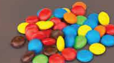
BONBON (KARISIK RENKLİ) (MINİ / MAXİ) BONBON (COLORFUL) (MINI / MAXI) 1 Kg x 8 Kase / 1 Kg x 8 Plastic Box 15 - 20°C Sıcaklıkta / In 15 - 20°C Temperature