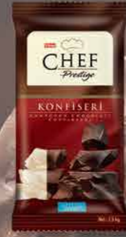
BITTER KUVERTÜR KONFİSERİ DARK COMPOUND CHOCOLATE COUVERTURE 2,5 Kg x 10 Blok / 2,5 Kg x 10 Block 15 - 20°C Sıcaklıkta / In 15 - 20°C Temperature