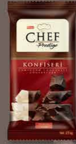
SÜTLÜ KUVERTÜR KONFİSERİ MILK COMPOUND CHOCOLATE COUVERTURE 2,5 Kg x 10 Blok / 2,5 Kg x 10 Block 15 - 20°C Sıcaklıkta / In 15 - 20°C Temperature