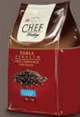
BITTER DAMLA KOKOLİN DARK DROP COMPOUND CHOCOLATE 1 Kg x 10 Poşet / 1 Kg x 10 Bag 15 - 20°C Sıcaklıkta / In 15 - 20°C Temperature