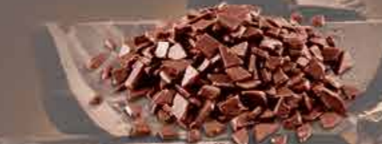
SÜTLÜ PARÇA KOKOLİN (4-7MM / 7-9MM) (MAT/PARLAK) MILKY COMPOUND CHOCOLATE CHIPS (4-7MM / 7-9MM) (MAT/POLISHED) 3 Kg x 4 Kutu / 3 Kg x 4 Box 15 - 20°C Sıcaklıkta / In 15 - 20°C Temperature