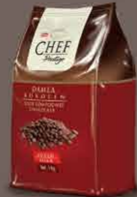
SÜTLÜ DAMLA KOKOLİN MILKY DROP COMPOUND CHOCOLATE 1 Kg x 10 Poşet / 1 Kg x 10 Bag 15 - 20°C Sıcaklıkta / In 15 - 20°C Temperature