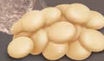
FİLDİŞİ PUL KOKOLİN WHITE COMPOUND CHOCOLATE CALLETS 3 Kg x 4 Kutu / 3 Kg x 4 Box 15 - 20°C Sıcaklıkta / In 15 - 20°C Temperature