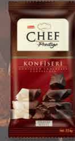
BITTER KUVERTÜR KONFİSERİ WHITE COMPOUND CHOCOLATE COUVERTURE 2,5 Kg x 10 Blok / 2,5 Kg x 10 Block 15 - 20°C Sıcaklıkta / In 15 - 20°C Temperature