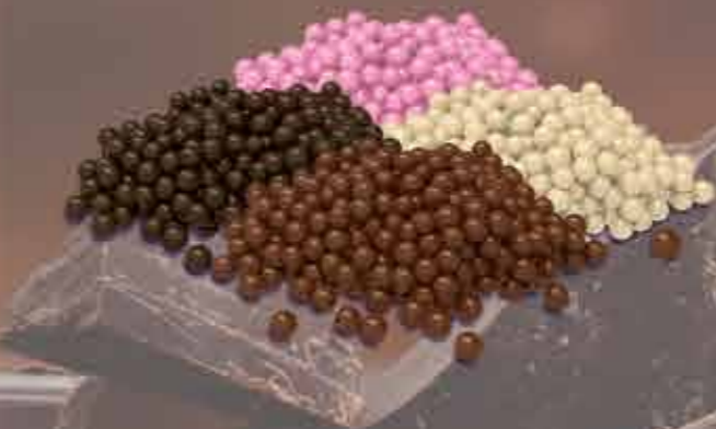
KONFİSERİ KAPLI PİRİNÇ PATLAĞI (SÜTLÜ / BITTER / FİLDİŞİ) COMPOUND CHOCOLATE COVERED CRISPS (MILKY / DARK / WHITE) 1 Kg x 8 Kase / 1 Kg x 8 Plastic Box 15 - 20°C Sıcaklıkta / In 15 - 20°C Temperature