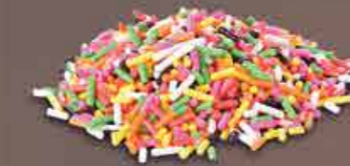
VERMICELLİ (SARI / PEMBE / KAHVERENGİ) VERMICELLI (YELLOW / PINK / BROWN) 1 Kg x 8 Kase / 1 Kg x 8 Plastic Box 15 - 20°C Sıcaklıkta / In 15 - 20°C Temperature