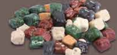
KOMANDO ÇAKIL TAŞI (4-7 MM / 7-9 MM) STONE COMPOUND CHOCOLATE (4-7MM / 7-9MM) 1 Kg x 8 Kase / 1 Kg x 8 Plastic Box 15 - 20°C Sıcaklıkta / In 15 - 20°C Temperature