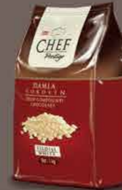
FİLDİŞİ DAMLA KOKOLİN WHITE DROP COMPOUND CHOCOLATE 1 Kg x 10 Poşet / 1 Kg x 10 Bag 15 - 20°C Sıcaklıkta / In 15 - 20°C Temperature