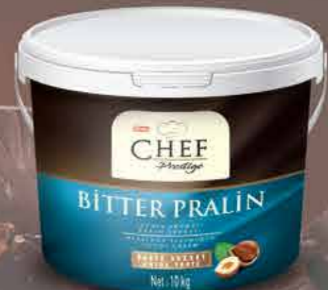
FINDIK AROMALI KAKAO KREMASI HAZELNUT FLAVOURED COCOA CREAM 10 Kg x Hova / 10 Kg Bucket 15 - 20°C Sıcaklıkta / In 15 - 20°C Temperature