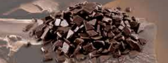
BITTER PARÇA KOKOLİN (4-7MM / 7-9MM) (MAT/PARLAK) DARK COMPOUND CHOCOLATE CHIPS (4-7MM / 7-9MM) (MAT/POLISHED) 3 Kg x 4 Kutu / 3 Kg x 4 Box 15 - 20°C Sıcaklıkta / In 15 - 20°C Temperature