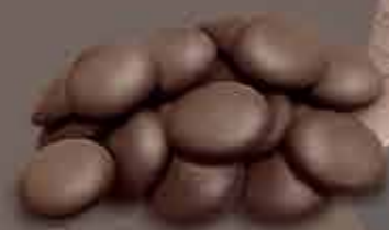
BITTER PUL KOKOLİN DARK COMPOUND CHOCOLATE CALLETS 3 Kg x 4 Kutu / 3 Kg x 4 Box 15 - 20°C Sıcaklıkta / In 15 - 20°C Temperature