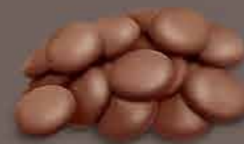
SÜTLÜ PUL KOKOLİN MILKY COMPOUND CHOCOLATE CALLETS 3 Kg x 4 Kutu / 3 Kg x 4 Box 15 - 20°C Sıcaklıkta / In 15 - 20°C Temperature